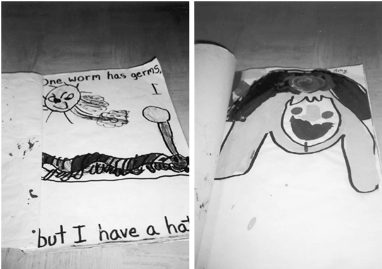
Two pages from one group of kindergartners' version of Ten Cats Have Hats.

The ants go marching one by one, Hurrah! Hurrah! The ants go marching one by one, Hurrah! Hurrah! The ants go marching one by one, The little one stops to have some fun, And they all go down to the ground, To get out of the sun. Boom! Boom! Boom!