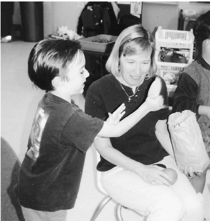
After listening to The Hungry Thing , preschoolers use plastic foods and paper bags located at a literacy center to create their own lunches. Spontaneous retellings and language play often occur at this time.