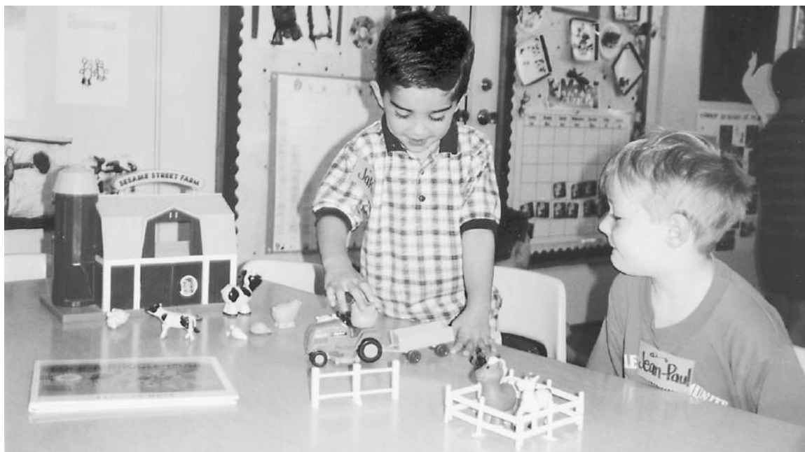
A set of farm animals placed at a literacy center with the recently shared book Cock-a-doodle moo! stimulates further play with sounds and reenactment of the story.