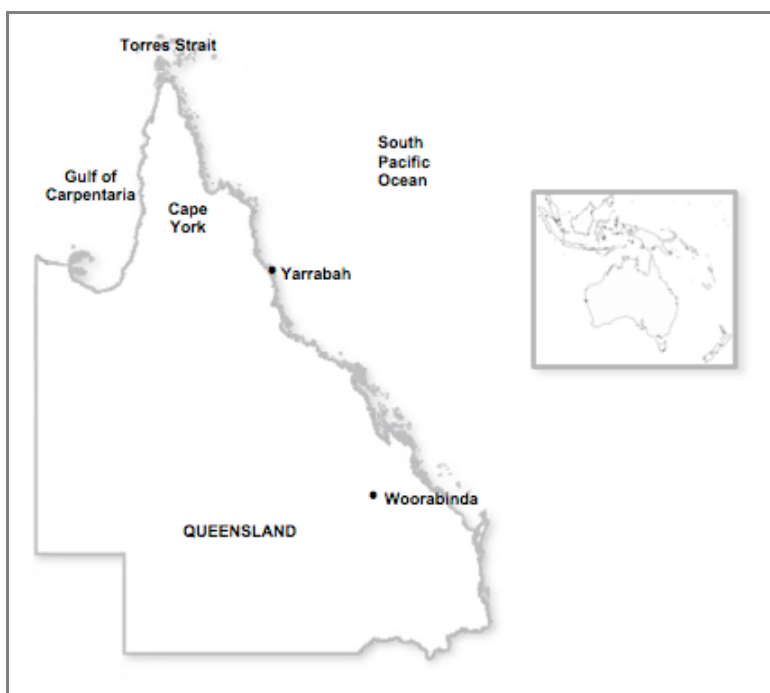
Figure 1: Map of Queensland, with inset showing Australia, south-east Asia and the south Pacific

Intensive contact between Indigenous peoples and English speakers began later in Queensland than in some southern Australian states and proceeded at different rates