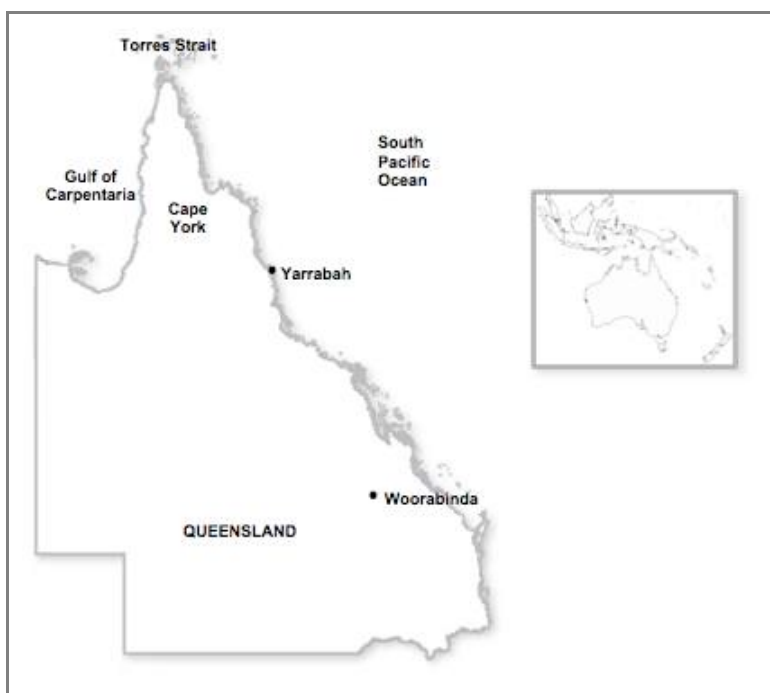
Figure 1: Map of Queensland, with inset showing Australia, south-east Asia and the south Pacific

Intensive contact between Indigenous peoples and English speakers began later in Queensland than in some southern Australian states and proceeded at different rates